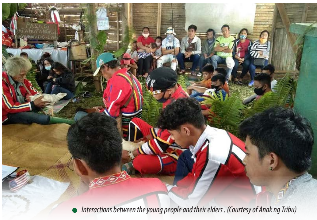
● Interactions between the young people and their elders.

There he met a staff from Samdhana Institute, who himself is of the Higaonon tribe. The chance meeting created the bridge for partnership between Anak ng Tribu and Samdhana. They were invited to the first Indigenous Youth Eco-Cultural Camp co-organized by Samdhana with Higaonon and Bukidnon ancestral domain communities. Setting the directions for a programmatic engagement with Samdhana, they were able to lay-out their youthful ambitions into a five-year strategic plan. They used the first support to improve their organization, agreeing to focus beyond being a cultural performing group, to take on other goals for their development and organize themselves.